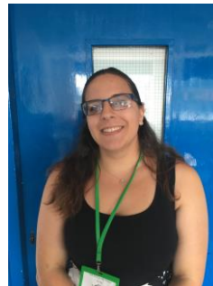
Class 9 (3N)