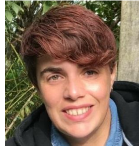
Class 7 (3W)