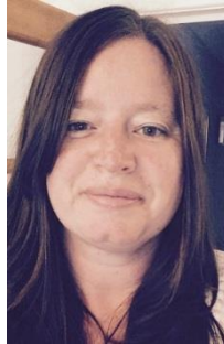
Class 8 (3M)