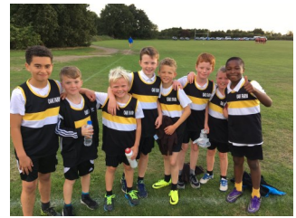
The victorious team!

Yesterday, our boys' and girls' cross country teams took part in the annual Uxbridge and District Cross Country Championships. Over a 2km course, all of our runners performed brilliantly. Out of the 9 schools competing, our girls placed a very creditable 4th, with all of the girls running strongly.